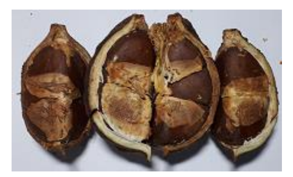
Figure 1. Andiroba fruit with seeds after falling from the tree.

The oil from andiroba seeds was extracted by a resident of Mamangal community (01°53'274''S; 49°01'701''W), located on the banks of Mamangal Grande River. The extraction method used was the traditional one, which began with the manual collection of seeds in places, such as the forest, under trees, floating on Mamangal Grande river, or in floodplain areas. The next phase consisted of seed selection, based on color, smell, and germination process. Then, the selected nuts were subjected to cooking over a wood fire for about an hour and a half, and the correct cooking point was verified by shell breaking and nut flexibility. In resting phase, the seeds were placed in a pan and kept for 30 days. After that period, the pulp was removed, molded into ball shapes (andiroba bread) and placed on a board. This extraction phase lasted 25 days and the andiroba bread was smashed two to five times/day [18].