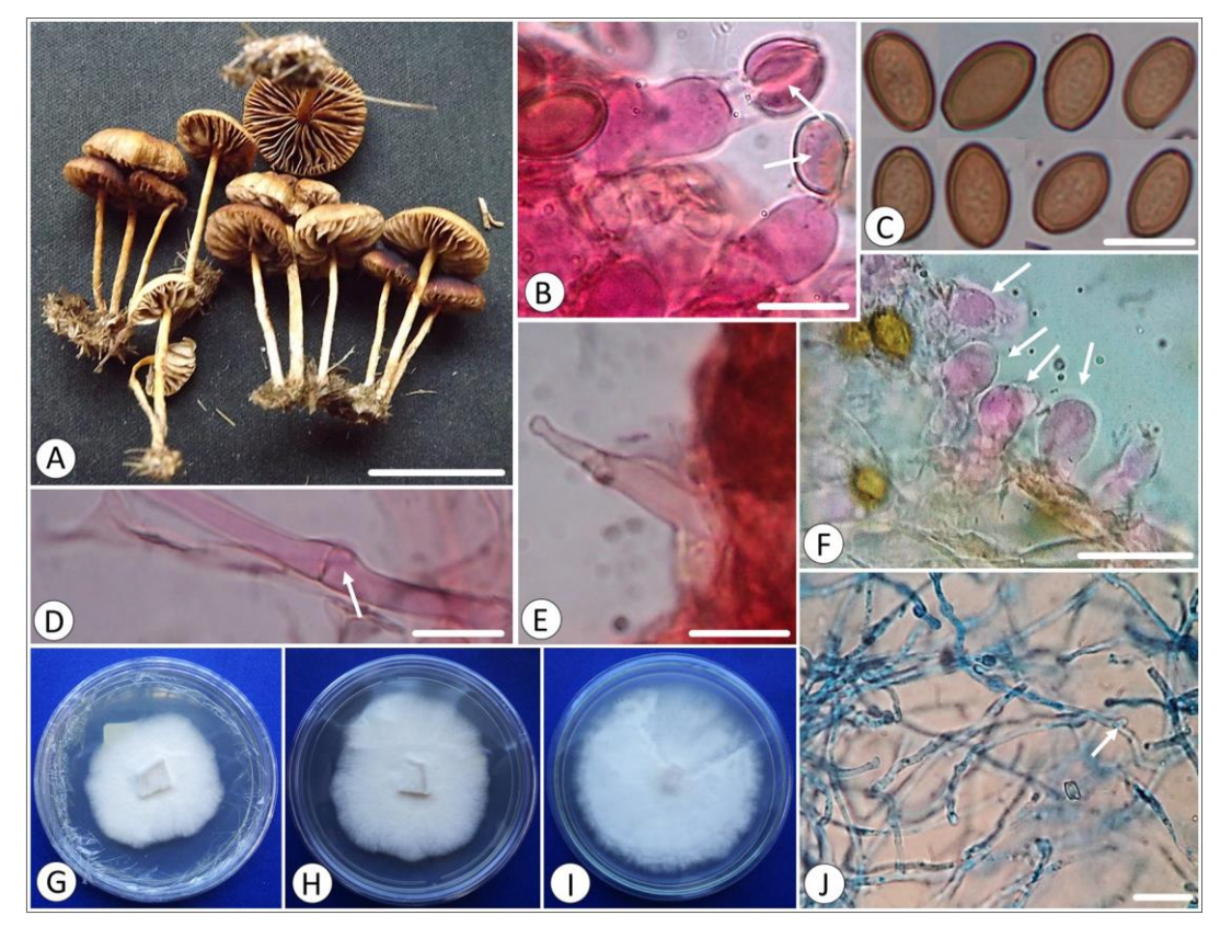
Figure 1: Agrocybe pediades. (A) Basidiomes. (B) Two and four-sterigmate basidia with young spores in formation (arrows, dyed with floxine). (C) Basidiospores (not stained). (D) Clamp-connection (arrow). (E) Irregularly lageniform to narrowly utriform cheilocystidia. (F) Clavate elements of pileipellis (arrows). (G) Two weeks of A. pediades culture in PDA medium. (H) Three weeks culture in PDA medium. (I) Four weeks culture in PDA medium, with 7–8 cm (Ø). (J) Monomitic hyphae system from culture in PDA medium, dyed with lactophenol cotton blue. Scale bars (A) = 2 cm, (B–F) = 10 μm, (J) = 20 μm.

dung), increasing the records of coprophilous/fimicolous basidiomycetes that occur in Brazil Central to four species [16]. Before that, the validated records of this species were only for the Southern Region of Brazil, with the predominance of the Pampa and Atlantic Forest biomes [11, 16].