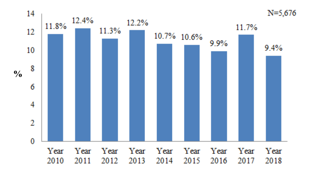
Figure 1: Percentage of confirmed cases of tuberculosis in Natal-RN, between the years 2010 to 2018.

In 2011, the highest number of cases was reported, 12.4%, followed by the years 2013 and 2010 with 12.2% and 18.1% of the notifications. The implementation of rapid diagnostics from 2011 can help to justify the large number of cases reported in the same year in the city of Natal-RN. However, it is widely evidenced that the Brazilian Northeastern capitals, especially the coastal capitals, due to larger urban agglomerations, present greater difficulty in controlling and combating the disease, making it a major challenge to reduce the number of cases over the years [10].